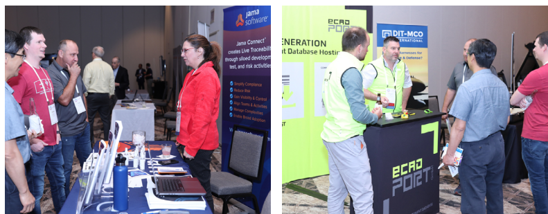
Last year's events exceeded expectations